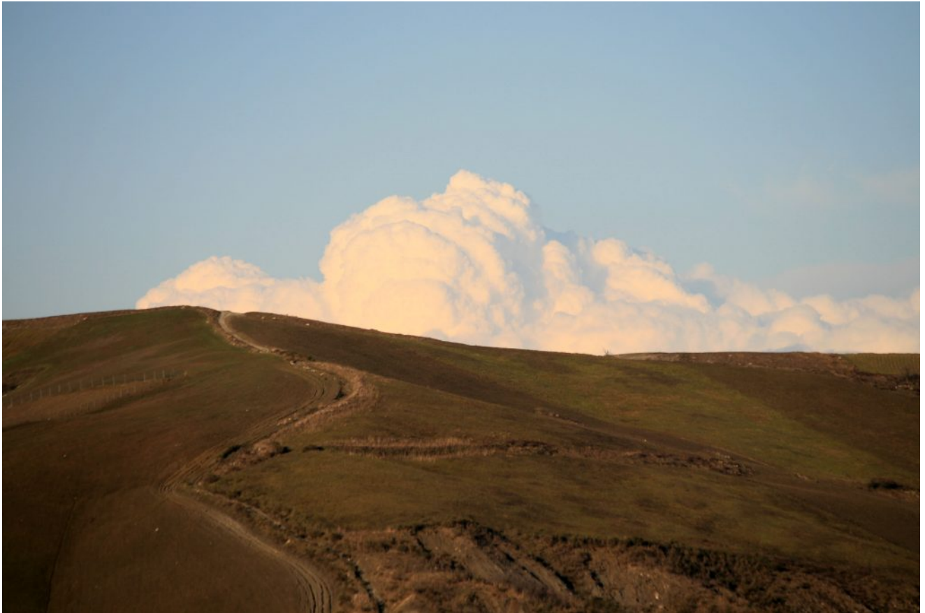
Costa del Vento in February

Setters running in wide open plains, setters used in woods, or among briars and bushes, were doing well, proving to be a quite versatile and adaptable breed but, my gut feelings kept telling me something was still out of place. I had old pictures of setters on the moor in my books and on my walls, they were black and white pictures and I could not figure out the colours. In 2008, at the CLA Gamefair, I purchased the GWT (Gamekeepers Welfare Trust) Ladies & Gamekeepers Calendar: the moor was shining in purple! It was not just the heather: the sky and the light were coming in different shades of violet, the whole atmosphere was purple! It was so surreal, so magic! I thought the colours had been recreated using Photoshop. I can be pretty naïve sometimes!