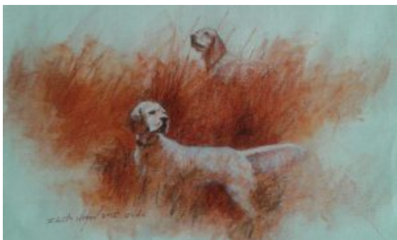
Painting by Roberto Noguel

During trials, British pointing dogs are expected to run with a brace mate, snipe trials and some woodcock and mountain trials (plus the Puppy Derby) are the only exception. HPRs (continental pointing dogs), instead, run alone. Each trial is made up of multiple Open Stakes, the number of the stakes is decided upon the number of the dog entered, there are usually about 12 braces in a stake. It is perfectly normal to have 3 or 4 Open Stakes running simultaneously. Stakes for younger dogs or for females only (Oaks) are very rare, but can take place sometimes, Novice stakes do not exist. Normally CAC trials are judged by one judge, while trials in which a CACIT is awarded require two judges. Each dog is expected to run for 15 minutes (if he does not make any eliminating mistakes...) and can be asked to have a second round, but a second round is not compulsory to be graded. Mistakes made during the first minute of the run are not taken into account.