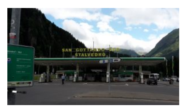
South Gotthard service station