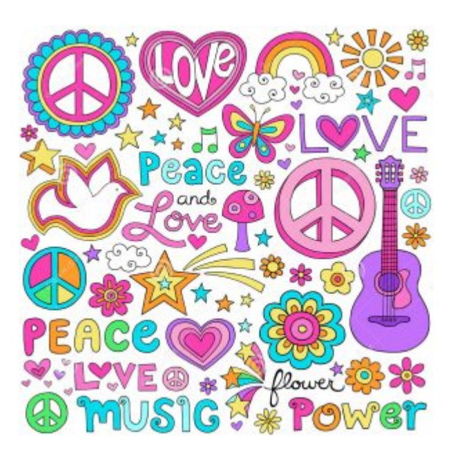
Ps. If I could make it, you can do it! Peace, love and happy training! I am in a happy/hippie mood tonight!