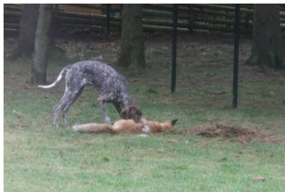
Flake and the fox

dog sits or stands with the delivery, I want my dog to be planted and steady. I also want to be able to stop my dog on the way in without her dropping the dummy or game, she should sit and wait for me to give her the come command, same goes for sending her out. Stop, sit and then I can send her left, right, back, or over a obstacle.