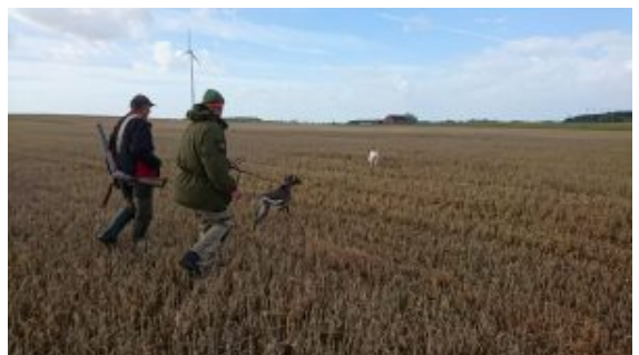
Tok & Flake

Feather training is one of those things you either believe in or you don't. It is no replacement for birds, but to teach a young dog to be steady and sit to the flush it does have its place. As said before, I made a mistake in teaching Flake to run a pattern simply for the sake of running, instead of giving her a reason to run a pattern. The very first field test I went to was a complete disaster, two days of running on fields and no one bird pointed and believe me she had the opportunity several times. I was basically stuck with a dog that would cut a field to shreds but did not know why she was doing it, running and hunting are not the same thing.