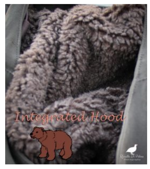
It's a bear!

My final review will come at the end of the winter, after a suitable amount of testing but, for now I can tell you that it is incredibly and comfortable and looks good on me. While references to the brand are very subtle (two H on the front pockets buttons and Harkila/Goretex writing on the left sleeve) its being high quality has been promptly spotted by a couple of curious hunters who asked me more information about it. So... stay tuned while I will "work" for my final review, and hopefully produce more pictures of me wearing it: fog and short dark days prevented me from taking more!