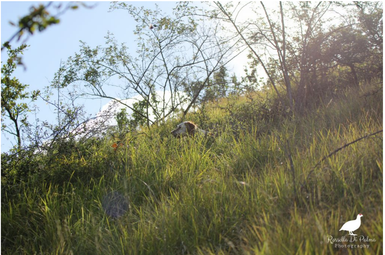
Briony pointing three pheasants

I then located a dog spa, also known as mud puddle, and sent Briony there so that she could refresh and relax. When we moved again towards the car, I was trying to keep her “high”, as I was hearing dogs and bells below us. Keeping her “high” she ended up climbing the mountain, running on a very steep and rocky area. Up on the top she pointed; you could hardly see her, I could spot a tiny white head hidden in the bushes, my friend could not see her, but he trusted me enough to join me on my walk on the rocks. There she was, beautifully pointing something: I was right! Still she was not ready to move ahead and she was right: three female pheasants were sitting right in front of her with no intention to move. In the meantime, the bells’ sound was getting closer and I did not want any dogs to ruin my work. I yelled (this was very Italian!) to pick up their dogs, or at least to re-direct them somewhere else: no dogs came close so... I must have been very convincing. In the meantime, I was also taking care of the dog, of the birds (who kept walking in the bush changing their