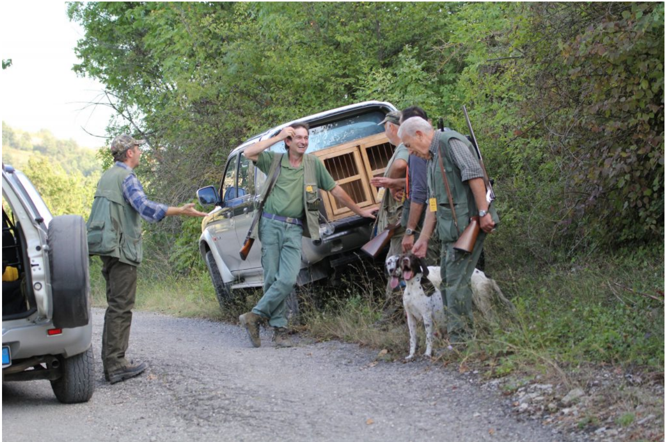
Meeting the watchers on the way down

direction) and of the “client”. I do not know how I could manage it and I am not sure I will be successful again dealing with such a task, but me and the dog succeeded in making the birds flying separately (one flew, dog steady, man shoot, dog roaded, second flew, dog steady...) and in a suitable direction to be shoot. Shooter got one and missed two, one of which went straight to the people downhill, below us. We asked them to come over and help with the retrieve and while they were climbing up, Briony pointed again, this time it was a handsome male pheasant which she roaded beautifully in the bushes, it was a long way, flushed it nicely, remained steady and the man eventually hit it and went to retrieve it by himself. I put the lead on and began walking downhill.