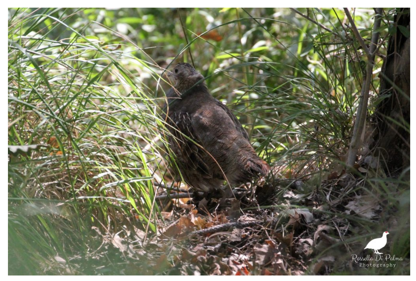
Perdix perdix (Grey Partridge)

Organizers were expecting 10-15 dogs to compete but 25 showed up: The dogs had different ages (many were around one year old) and very different backgrounds and training. There were experienced dogs who regularly attend trials and dogs, without formal training, which are used for rough shooting exclusively. According to the judge Ivan Torchio (whose mentor had been Giacomo Griziotti), all the dogs, including the best one, need to explore the ground with more "logic". He explained the difference between exploring the ground during a "quail" trial (dog should quarter very regularly (left/right), in a very geometric pattern and not miss any ground) and during a "wild bird" trial (the dog has more freedom but still....) and concluded saying that all the dogs he saw need to be refined under this aspect. Some dogs proved to be highly skilled and perfectly trained, they waited for the handler on point, roaded on command without being touched, remained steady, dropped and came back when asked to and so on...) others were wilder, some of them were very young and some others paid