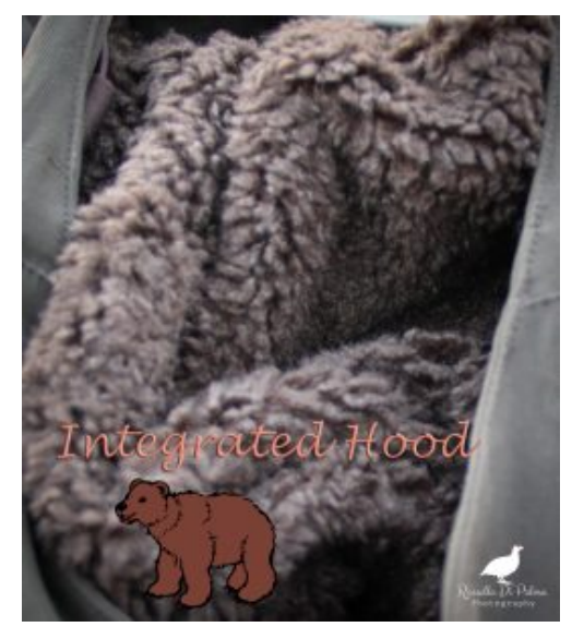
It's a bear!

My final review will come at the end of the winter, after a suitable amount of testing but, for now I can tell you that it is incredibly and comfortable and looks good on me. While references to the brand are very subtle (two H on the front pockets buttons and Harkila/Goretex writing on the left sleeve) its being high quality has been promptly spotted by a couple of curious hunters who asked me more information about it. So... stay tuned while I will "work" for my final review, and hopefully produce more pictures of me wearing it: fog and short dark days prevented me from taking more!