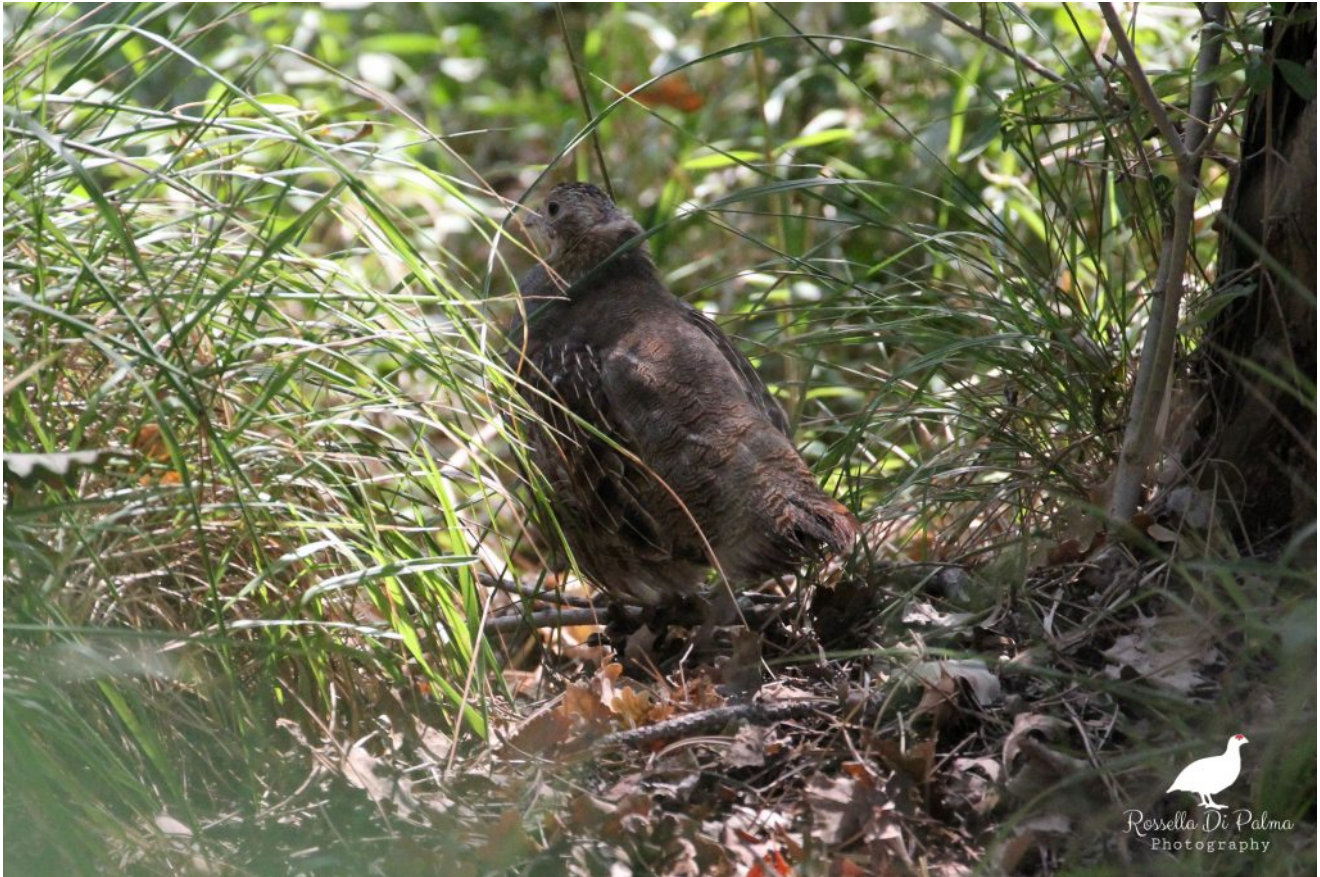
Perdix perdix (Grey Partridge)

Organizers were expecting 10-15 dogs to compete but 25 showed up: The dogs had different ages (many were around one year old) and very different backgrounds and training. There were some experienced dogs who regularly attend trials and dogs, without formal training, which are used for rough shooting exclusively. According to the judge Ivan Torchio (whose mentor had been Giacomo Griziotti), all the dogs, including the best one, need to explore the ground with more “logic”. He explained the difference between exploring the ground during a “quail” trial (dog should quarter very regularly (left/right), in a very geometric pattern and not miss any ground) and during a “wild bird” trial (the dog has more freedom but still...) and concluded saying that all the dogs he saw need to be refined under this aspect. Some dogs proved to be highly skilled and perfectly trained, they waited for the handler on point, roaded on command without being touched, remained steady, dropped and came back when asked to and so on...) others were wilder, some of them were very young and some others paid