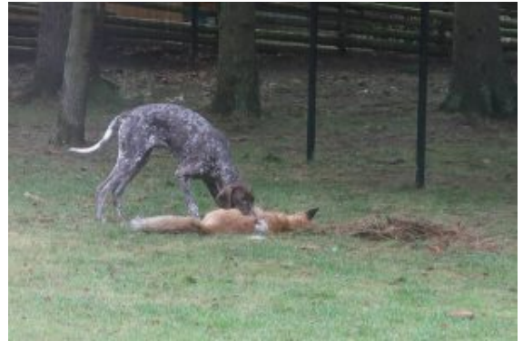
Flake and the fox

the way in without her dropping the dummy or game, she should sit and wait for me to give her the come command, same goes for sending her out. Stop, sit and then I can send her left, right, back, or over a obstacle.