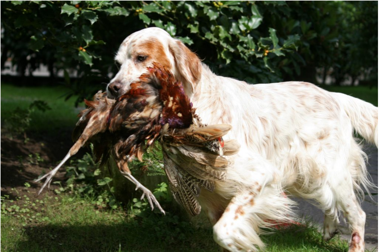
Socks at 13 years old retrieving a pheasant