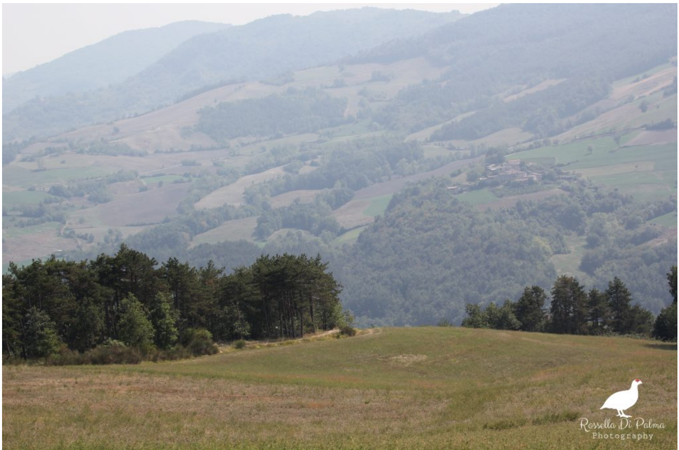
Ruino – Villa Alta

Last June I was invited to a trial organized by the UNCAA (National Union of Appennines and Alps Hunters) – ST. Hubert Academy, but the trial was later cancelled and re-scheduled for September. The grounds and the birds changed as well, the trial was going to be held at the Ruino Estate, on the highest hills of Oltrepo' Pavese , and the dogs were going to be assessed on grey partridges, no longer on quails Those who know me, are well aware of how much I love Ruino as I spent about eight years regularly shooting and handling English Setters there. Ruino's grounds are perfect for pointing dogs, and they are wide and open enough to make any dogs belonging to a British pointing breed happy.