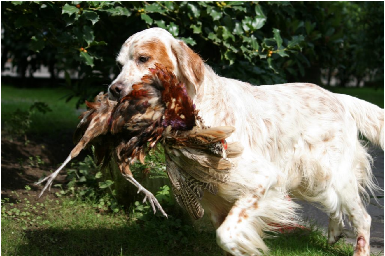
Socks at 13 years old retrieving a pheasant