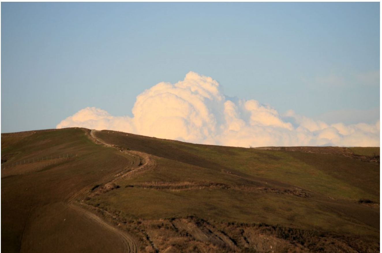
Costa del Vento in February

was missing. I enjoyed my time in the countryside, I kept reading, asking and following judges and more experienced hunters to learn more, but something I could not define was still missing. All that I knew was that I loved some shooting grounds more than others. I could mention Villa Alta in Ruino; Costa del Vento and Costa Pelata in Montalto – all of them in the Apennines and all of them, ironically – I would have discovered later – pretty moor-like. Other places were simply dull. Italians believe British pointing dogs need space, and justify “grand quete” and its extremes, on the premise that these dogs were born for the moors. My fellow countrymen think that is perfectly fine for an English Setter to run from a valley to another (while being tracked with a GPS collar) because it was created to run on moors. Pointers are allowed to run even wider, two or three valleys might be fine. I did not buy into this theory entirely, but I managed to keep my thoughts for myself. Maybe they were right but, to me, it was like they were trying to fit a foot in the wrong shoe.