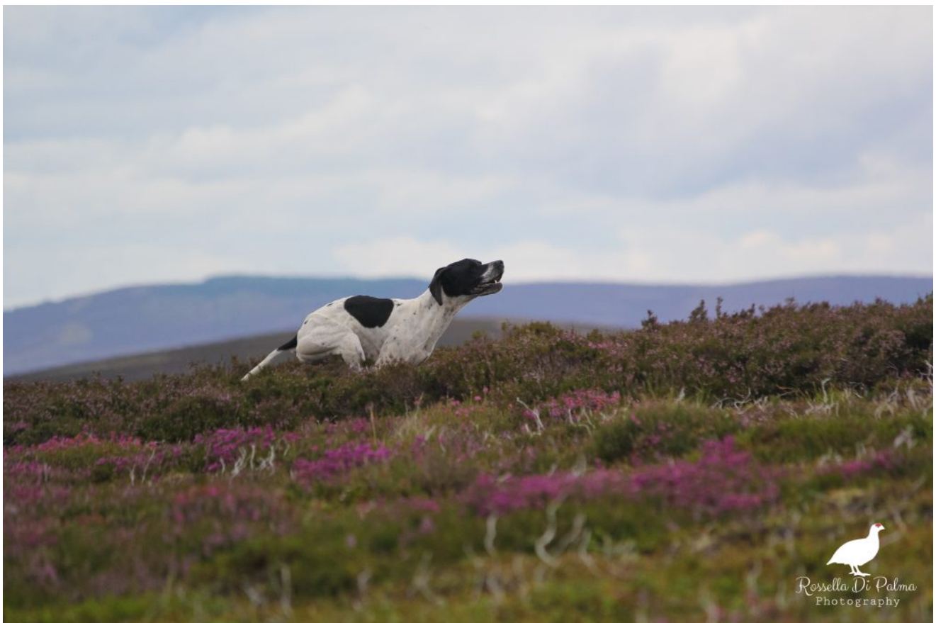
Dogs, purple heather, lavender skies

they are full of wonderful gifts, you just have to be sensitive enough to recognize them. I do not need woods, woodcock do not bewitch me: Italians love shooting woodcock over English Setters, they are fascinating birds, but I cannot honestly claim I love them. Grouse are different and they are great teachers, both challenging and patient, I think they are probably one of the best birds for training pointing dogs. Also, I do not consider woods to be the ideal ground for an ES: trees and leaves prevent you from seeing the dog work, heather instead, while hiding grouse, leaves the dog under the spotlights.