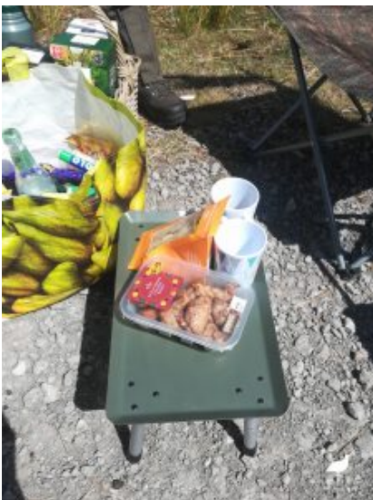
Lunch on the moor

As said earlier, trials start at 9 a.m. but might be located one, or even two hours away from where you are staying. To reach Masham trial in time, I woke up at 5 a.m., had breakfast and packed everything I needed to carry with me and to meet with friends on the way at 6.30 a.m. We reached the venue a bit earlier than planned, but you are somehow expected to be there well before the announced meeting time. Also, travel time on country roads is not very predictable with sheep and tractors ready to sabotage the best plans.