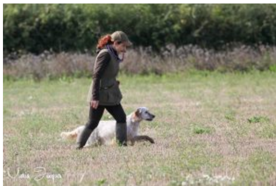
Haughton Hall, roading a hare :-)

overall, I could not complain. At the end of the circuit, I went home with no awards but determined to save money and to go back in 2017.