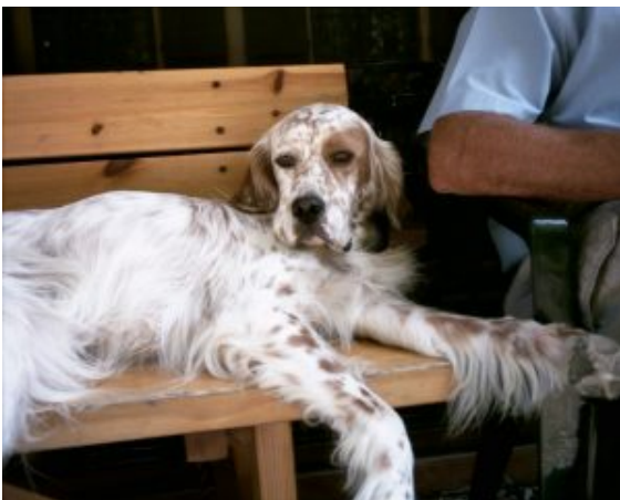
Socks (Slai di Riccagioia) my first ES