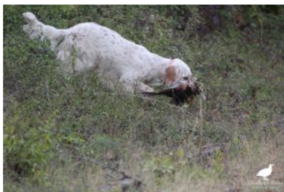
First day of 2017 hunting season

She was naughty, but smart, and she quickly developed in a good hunting companion. Sometimes she had a mind of her own and sometimes she was not the easiest dog to handle, but she surely did not lack of determination and bird sense. She was, and she still is, strong willed and sensitive at the same time. Thanks to friends, we had access to some private estates where she could meet much more birds that she could have met on more affordable – by me – public grounds. Other people introduced her to woodcock and, I still remember the day, with