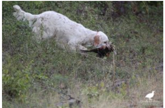
First day of 2017 hunting season

She was naughty, but smart, and she quickly developed in a good hunting companion. Sometimes she had a mind of her own and sometimes she was not the easiest dog to handle, but she surely did not lack of determination and bird sense. She was, and she still is, strong willed and sensitive at the same time. Thanks to friends, we had access to some private estates where she could meet much more birds that she could have met on more affordable – by me – public grounds. Other people introduced her to woodcock and, I still remember the day, with my surprise, she pointed her first snipe. During these hunting seasons, she learnt to work with other dogs and we worked a lot on backing and on remaining steady on point. I must admit I had good teachers, and that skilled hunters helped us to locate birds, but steadiness to wing was not required. Hunters here want the dogs to be steady on point, but after the bird flies, all they wish is to hit it, none cares anymore about the dog.