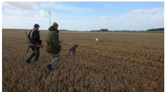
Tok & Flake

Feather training is one of those things you either believe in or you don't. It is no replacement for birds, but to teach a young dog to be steady and sit to the flush it does have its place. As said before, I made a mistake in teaching Flake to run a pattern simply for the sake of running, instead of giving her a reason to run a pattern. The very first field test I went to was a complete disaster, two days of running on fields and no one bird pointed and believe me she had the opportunity several times. I was basically stuck with a dog that would cut a field to shreds but did not know why she was doing it, running and hunting are not the same thing.