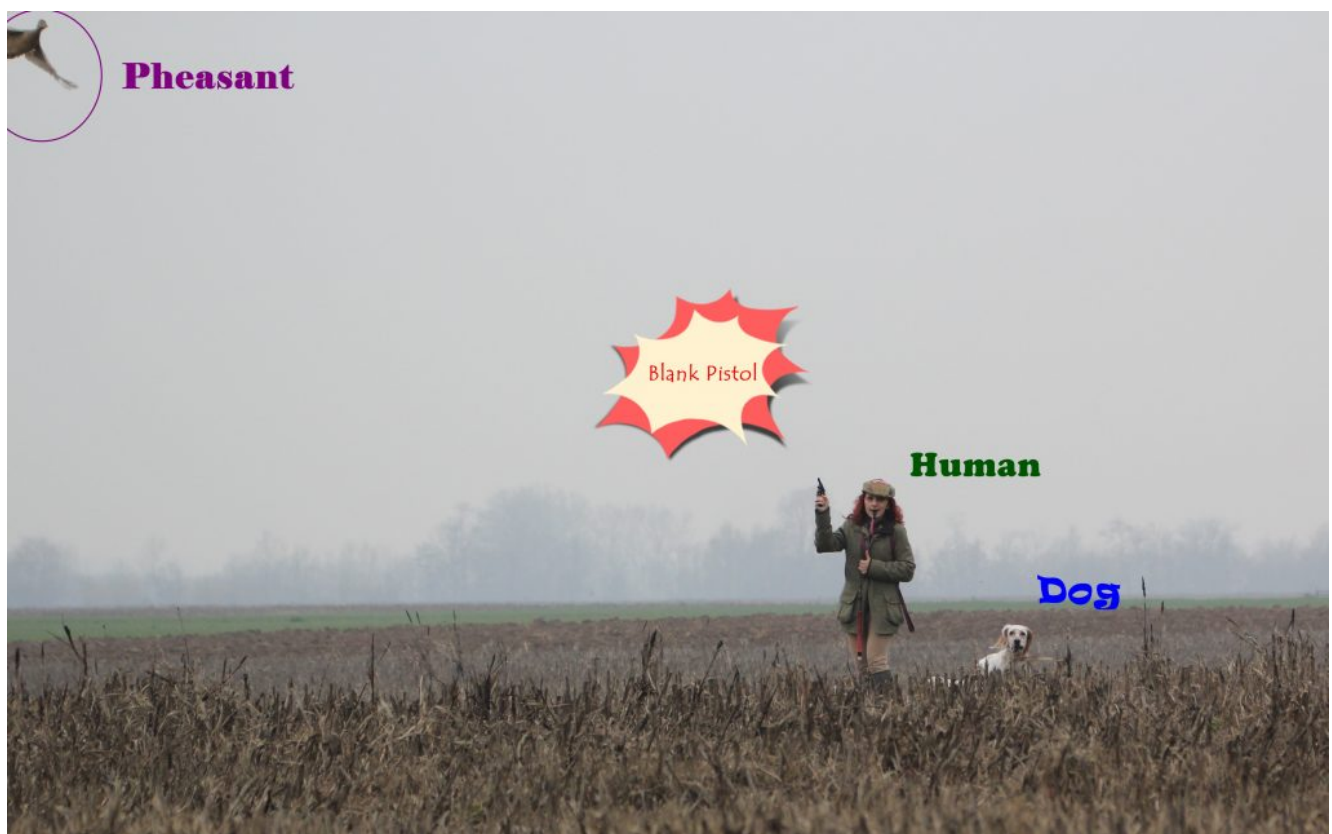
Blank pistol first

A dog that is not accustomed, nor trained, for this often has a hard time when things go wrong. Dogs hang or impale themselves on fences, run through glass doors or run in front of cars every year with the fireworks, my dogs either look for birds or lie sleeping through it. As said before in another article, break down your training, a dog should be able to retrieve before you introduce gunfire like training with the retrieving training. I start with a cast and clap of the hands, move on to a cast and blank pistol (plastic revolver with very low charge caps). When you start with the blank pistol it is a good idea to have another person doing the cast and the shooting, Shoot 10-12 meters away from the dog, keep the dog steady and offer a lot of verbal support. If the dog shows discomfort at the shot, move further away with the blank pistol, if it does not bother the dog, move closer. Do this for every type of "gunfire" you introduce, . 22,9mm and shotgun should be started at least 20-25 meters away from the dog, further is better. Increase the caliber progressively, do not go from blank pistol to gauge 12 shotgun directly!