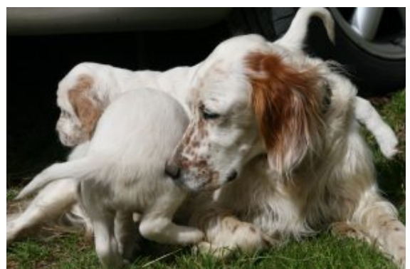
Ansa del Simano, Briony's

After his death, when I started looking for another setter, I had very clear ideas about what I wanted in my next dog, but not so clear ideas about where to find her! It took months, but I finally located my litter and my puppy, on a farm on the Swiss Alps, not too far from Sankt Moritz (posh dog!). I knew what I needed to know about Briony's dad, but mum was quite a surprise: she was beautiful, gentle and smart. She came with us heeling off lead to the small village's café and then sat quietly under the table. I loved that, as well the whole bloodline registered in the pedigree and the parents' health clearances. When I brought Briony home, people thought she was cute, but too expensive, and that I was going to "ruin" her, training her in my own way and socializing her too much. I just thought she was a terrible pup who did not like me at all. It took quite a while to become friends, probably she was just testing me to be sure she was in good hands!