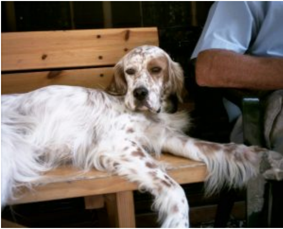
Socks (Slai di Riccagioia) my first ES

After his death, when I started looking for another setter, I had very clear ideas about what I wanted in my next dog, but not so clear ideas about where to find her! It took months, but I finally located my litter and my puppy, on a farm on the Swiss Alps, not too far from Sankt Moritz (posh dog!). I knew what I needed to know about Briony's dad, but mum was quite a surprise: she was beautiful, gentle and smart. She came with us heeling off lead to the small village's café and then sat quietly under the table. I loved that, as well the whole bloodline registered in the pedigree and the parents' health clearances. When I brought Briony home, people thought she was cute, but too expensive, and that I was going to "ruin" her, training her in my own way and socializing her too much. I just thought she was a terrible pup who did not like me at all. It took quite a while to become friends, probably she was just testing me to be sure she was in good hands!