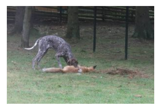
Flake and the fox

turns back. The dog should come in to your left, sit and present the dummy or game. Lots of folks do not mind if the dog sits or stands with the delivery, I want my dog to be planted and steady. I also want to be able to stop my dog on the way in without her dropping the dummy or game, she should sit and wait for me to give her the come command, same goes for sending her out. Stop, sit and then I can send her left, right, back, or over a obstacle.