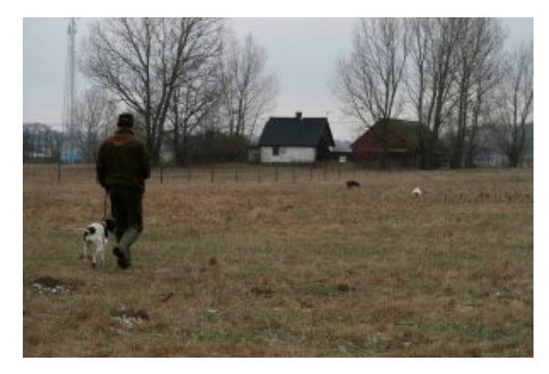
Flake and English Pointers

multiple disciplines, with contradictory commands and outcomes, phase many owners. I do not expect my dog to compete against a pure retriever when it comes to retrieving, but I train her with pure retrievers and she will be on pair with any average pure retriever any day I do not expect her to run like a English Pointer, but I run her with English Pointers and she may not go as wide and as deep, but she goes just as hard. HPR dogs are not the best at everything, but they are the best choice for everything. I cannot say this enough, you are investing time and effort into training a dog, make the wise choice and get a Old School Legend to help you! No clickers, no treats just respect, discipline and loyalty.