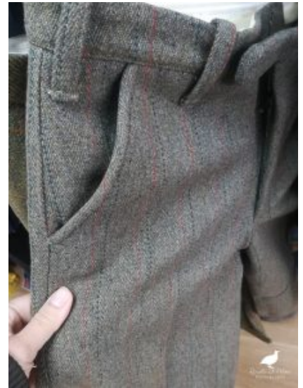
One of the two breeks

Here in Italy, some parishes organize a charity draft (the Italian literal translation would be a “charity fish”) yearly, but most the items you can win by purchasing a ticket are far away from being nice things to look at... and no second hand clothes at these fisheries.