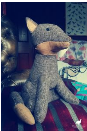
My Tweed Fox

What are charity shops? They are shops managed by different charities and that sell items that people donated them. As you can guess, all the profits go to charity and most of the employees are volunteers. What you can find in a charity shop is usually second-hand, but I managed to find a tweed hat and a tweed door stopper (in a fox shape) which were new with labels. Among the other things, they sell figurines, books, prints, mugs, watches, frames, mugs and... clothes! It has become an habit, for me, to go and raid all the local charity shops each time I go to England .