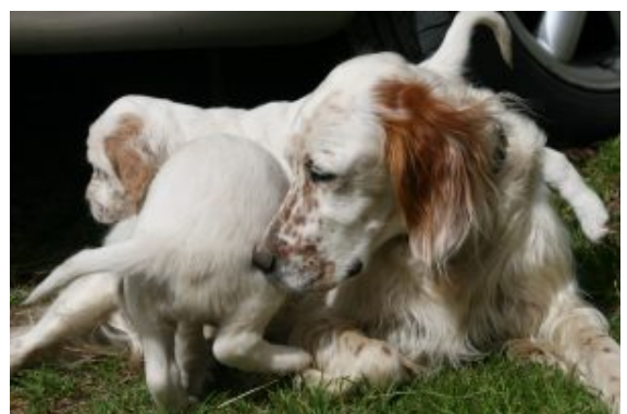
Ansa del Simano, Briony's

After his death, when I started looking for another setter, I had very clear ideas about what I wanted in my next dog, but not so clear ideas about where to find her! It took months, but I finally located my litter and my puppy, on a farm on the Swiss Alps, not too far from Sankt Moritz (posh dog!). I knew what I needed to know about Briony's dad, but mum was quite a surprise: she was beautiful, gentle and smart. She came with us heeling off lead to the small village's café and then sat quietly under the table. I loved that, as well the whole bloodline registered in the pedigree and the parents' health clearances. When I brought Briony home, people thought she was cute, but too expensive, and that I was going to "ruin" her, training her in my own way and socializing her too much. I just thought she was a terrible pup who did not like me at all. It took quite a while to become friends, probably she was just testing me to be sure she was in good hands!