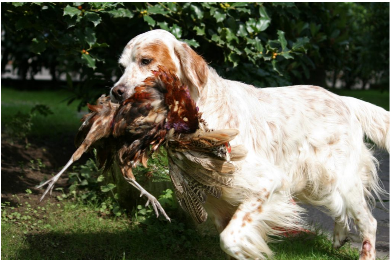
Socks at 13 years old retrieving a pheasant

all the reasons to behave like he did but...living with him was hell! I follow the manual: undertook a behavioral therapy; enrolled him in an obedience class; started him as a search & rescue dog and even gave him antidepressants, improvements, however, were small and slow. His breeder, happy to know the dog had been safely re-homed, gave me his pedigree and I realized Socks was meant to be a working dog, he even had a great ancestry. He was my first "gundog" but, my previous experience with other breeds told me that, MAYBE, letting him do the job he was born for, could have helped him to overcome all his fears.