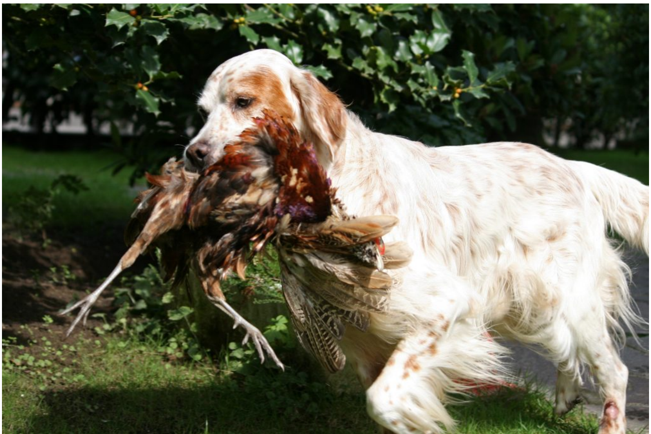
Socks at 13 years old retrieving a pheasant

all the reasons to behave like he did but...living with him was hell! I follow the manual: undertook a behavioral therapy; enrolled him in an obedience class; started him as a search & rescue dog and even gave him antidepressants, improvements, however, were small and slow. His breeder, happy to know the dog had been safely re-homed, gave me his pedigree and I realized Socks was meant to be a working dog, he even had a great ancestry. He was my first "gundog" but, my previous experience with other breeds told me that, MAYBE, letting him do the job he was born for, could have helped him to overcome all his fears.