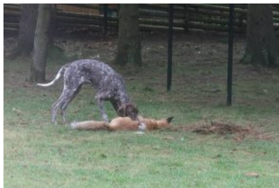
Flake and the fox

dog sits or stands with the delivery, I want my dog to be planted and steady. I also want to be able to stop my dog on the way in without her dropping the dummy or game, she should sit and wait for me to give her the come command, same goes for sending her out. Stop, sit and then I can send her left, right, back, or over a obstacle.