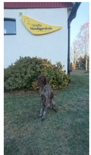
Flake goes to school

I can write a hundred more points to ponder, but that's not the point.