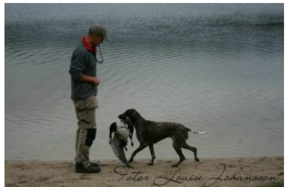
Tok & Flake

Stand as close to the water edge as the judge would allow, Stay calm and positive, do not reach or grab for the bird, but be fast enough so the dog can shake itself dry if it wants to after delivery.