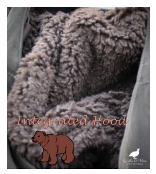
It's a bear!

My final review will come at the end of the winter, after a suitable amount of testing but, for now I can tell you that it is incredibly and comfortable and looks good on me. While references to the brand are very subtle (two H on the front pockets buttons and Harkila/Goretex writing on the left sleeve) its being high quality has been promptly spotted by a couple of curious hunters who asked me more information about it. So... stay tuned while I will "work" for my final review, and hopefully produce more pictures of me wearing it: fog and short dark days prevented me from taking more!