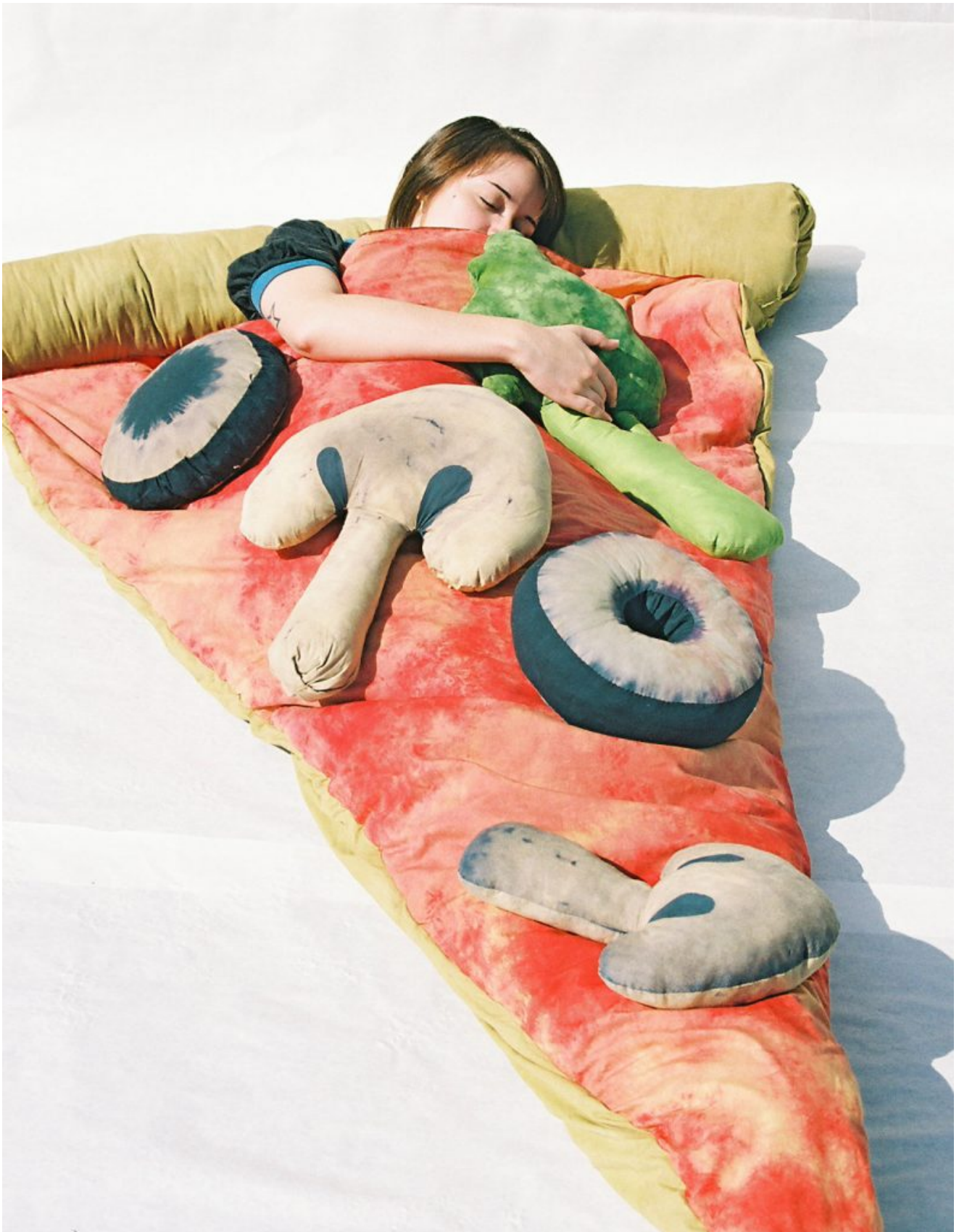
Pizza Sleeping Bag https://www.etsy.com/listing/96236038/plain-slice-of-pizza-sleeping-bag

You call the number you have found: none answers because that