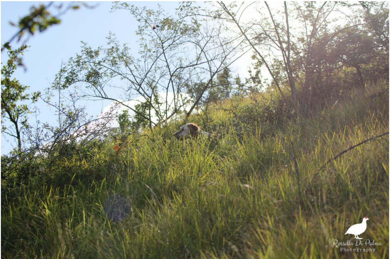
Briony pointing three pheasants

I then located a dog spa, also known as mud puddle, and sent Briony there so that she could refresh and relax. When we moved again towards the car, I was trying to keep her “high”, as I was hearing dogs and bells below us. Keeping her “high” she ended up climbing the mountain, running on a very steep and rocky area. Up on the top she pointed; you could hardly see her, I could spot a tiny white head hidden in the bushes, my friend could not see her, but he trusted me enough to join me on my walk on the rocks. There she was, beautifully pointing something: I was right! Still she was not ready to move ahead and she was right: three female pheasants were sitting right in front of her with no intention to move. In the meantime, the bells’ sound was getting closer and I did not want any dogs to ruin my work. I yelled (this was very Italian!) to pick up their dogs, or at least to re-direct them somewhere else: no dogs came close so... I must have been very convincing. In the meantime, I was also taking care of the dog, of the birds (who kept walking in the bush changing their