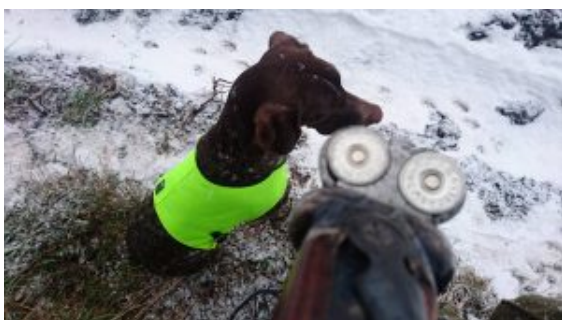
Flake in Sweden...

Two years ago I came into the hunting dogs world, I knew nothing, I could not make a dog sit or stay, much less retrieve, track or hunt birds. Sure I tried and watched videos and read as much as I could, but it is not the same. I saw a man handle a dog in the field one day, and I understood that I needed help. Needed may be the wrong word, craved is more in line with what I felt.