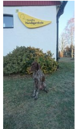
Flake goes to school

I can write a hundred more points to ponder, but that's not the point.