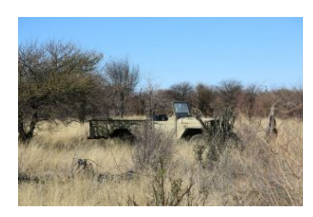
I dreamt of Africa...

Heat and exhaustion play havoc with a pointing dogs ability to find birds. Keep the dog hydrated, do not run them for more than 15 minutes in the heat (calculate the resting time