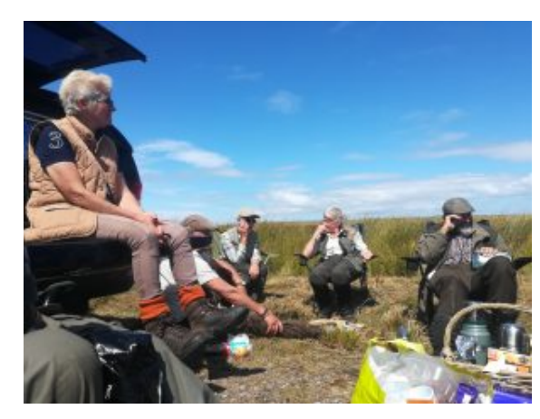
Lunch on the moor

As said earlier, trials start at 9 a.m. but might be located one, or even two hours away from where you are staying. To reach Masham trial in time, I woke up at 5 a.m., had breakfast and packed everything I needed to carry with me and to met with friends on the way at 6.30 a.m. We reached the venue a bit earlier than planned, but you are somehow expected to be there well before the announced meeting time. Also, travel time on country roads is not very predictable with sheep and tractors ready to sabotage the best plans.