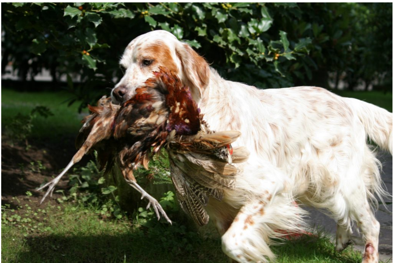
Socks at 13 years old retrieving a pheasant

developed a severe form of separation anxiety. I knew he had been poorly socialized, kept kenneled for three years and then trained (aka abused) by a professional trainer. I knew he had all the reasons to behave like he did but...living with him was hell! I follow the manual: undertook a behavioral therapy; enrolled him in an obedience class; started him as a search & rescue dog and even gave him antidepressants, improvements, however, were small and slow. His breeder, happy to know the dog had been safely re-homed, gave me his pedigree and I realized Socks was meant to be a working dog, he even had a great ancestry. He was my first "gundog" but, my previous experience with other breeds told me that, MAYBE, letting him do the job he was born for, could have helped him to overcome all his fears.