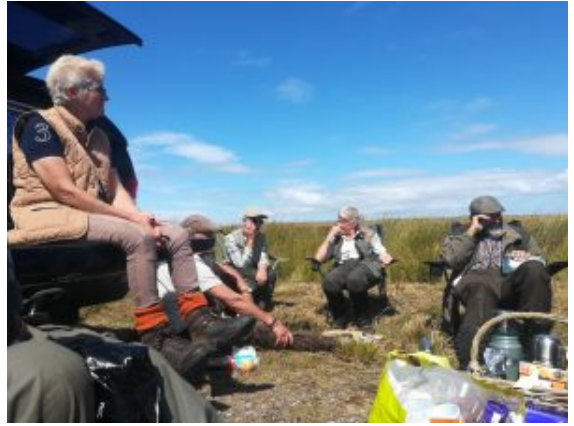
Lunch on the moor

As said earlier, trials start at 9 a.m. but might be located one, or even two hours away from where you are staying. To reach Masham trial in time, I woke up at 5 a.m., had breakfast and packed everything I needed to carry with me and to met with friends on the way at 6.30 a.m. We reached the venue a bit earlier than planned, but you are somehow expected to be there well before the announced meeting time. Also, travel time on country roads is not very predictable with sheep and tractors ready to sabotage the best plans.