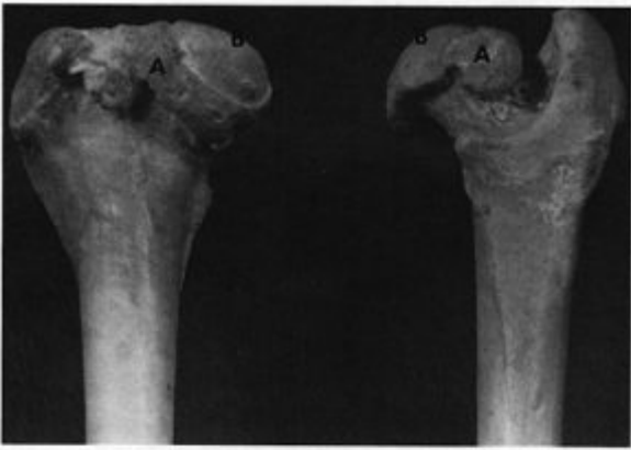
FIG. 83-14 The proximal ends of two femora illustrate the effects of advanced hip dysplasia. New-bone formation (exostoses) encircles the femoral necks at the junction of the head and neck (A). The femoral heads are shortened from wear and the cartilage surfaces are eroded and eburnated (B). (Reproduced with permission from Riser WH: The dysplastic hip joint: Its radiographic and histologic development. JAVRS 14:35, 1973)

Joint incongruity can generate friction which, on its turn, can increase temperatures inside the joint. It has been estimated that temperatures – inside an affected joint -can reach up to 70° Celsius (158°F) in a dysplastic hip joint (dog running).