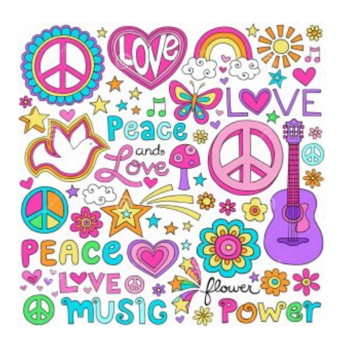
Ps. If I could make it, you can do it! Peace, love and happy training! I am in a happy/hippie mood tonight!