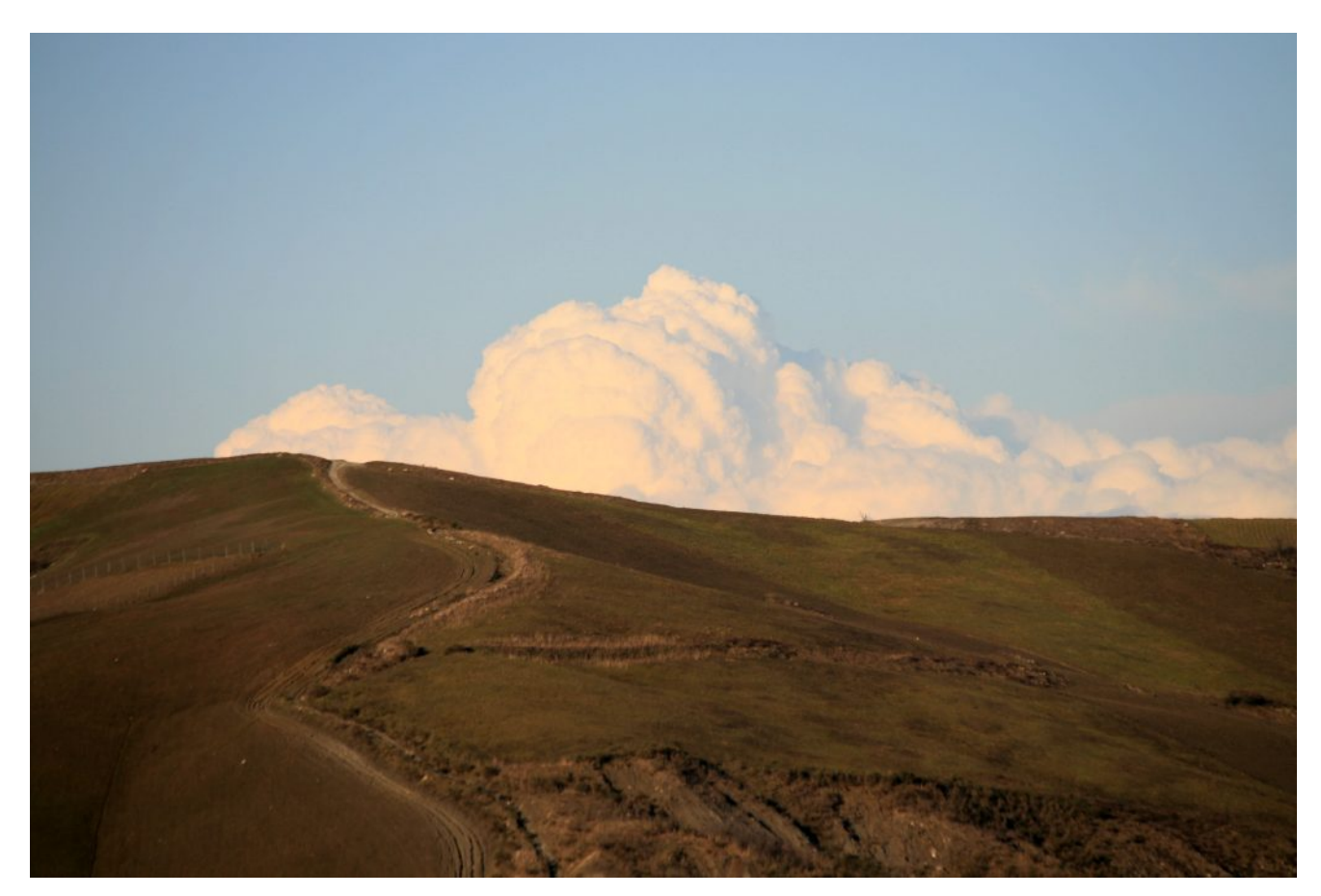
Costa del Vento in February

Setters running in wide open plains, setters used in woods, or among briars and bushes, were doing well, proving to be a quite versatile and adaptable breed but, my gut feelings kept telling me something was still out of place. I had old pictures of setters on the moor in my books and on my walls, they were black and white pictures and I could not figure out the colours. In 2008, at the CLA Gamefair, I purchased the GWT (Gamekeepers Welfare Trust) Ladies & Gamekeepers Calendar: the moor was shining in purple! It was not just the heather: the sky and the light were coming in different shades of violet, the whole atmosphere was purple! It was so surreal, so magic! I though the colours had been recreated using Photoshop. I can be pretty naïve sometimes!