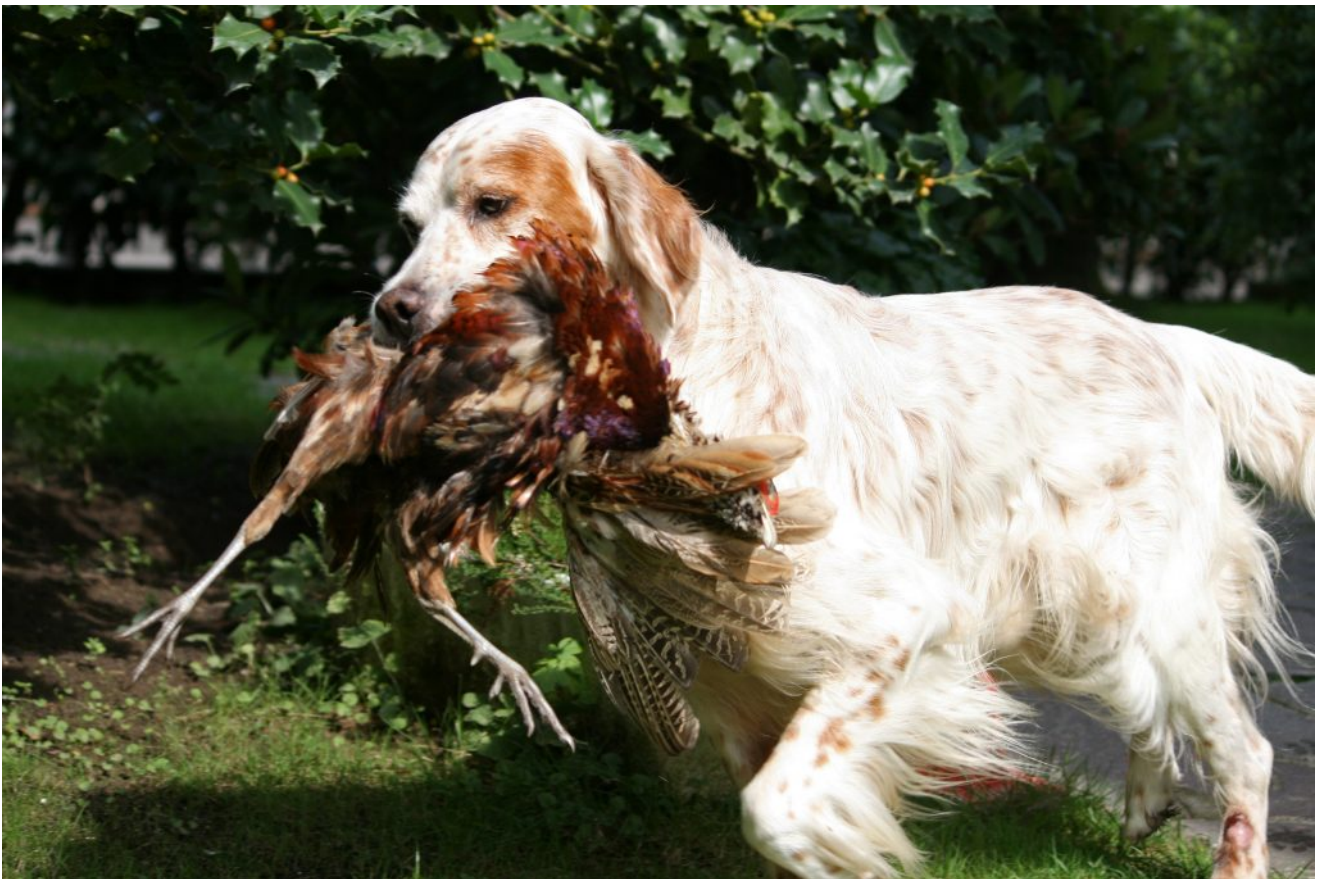
Socks at 13 years old retrieving a pheasant

all the reasons to behave like he did but...living with him was hell! I follow the manual: undertook a behavioral therapy; enrolled him in an obedience class; started him as a search & rescue dog and even gave him antidepressants, improvements, however, were small and slow. His breeder, happy to know the dog had been safely re-homed, gave me his pedigree and I realized Socks was meant to be a working dog, he even had a great ancestry. He was my first "gundog" but, my previous experience with other breeds told me that, MAYBE, letting him do the job he was born for, could have helped him to overcome all his fears.